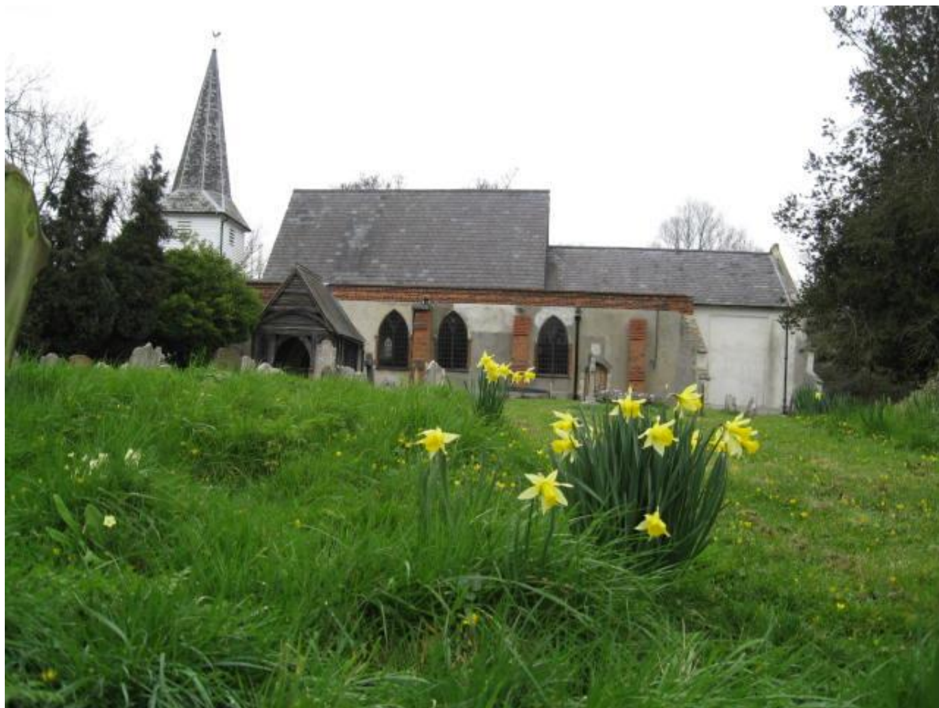
St. Mary & St. Edward's Church, West Hanningfield

St. Mary & St. Edward's Churchyard, West Hanningfield contains 3 Commonwealth War Graves – 2 relating to World War 1 & 1 from World War 2.