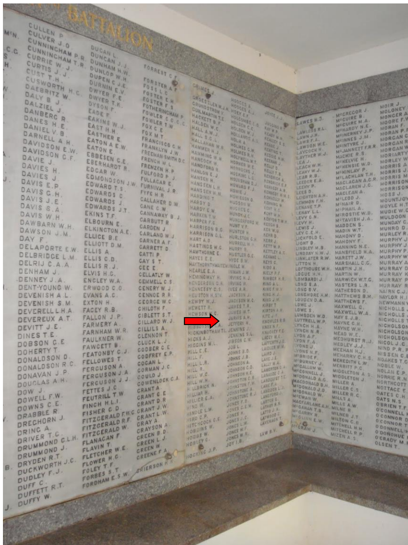
Panel showing 11th Battalion